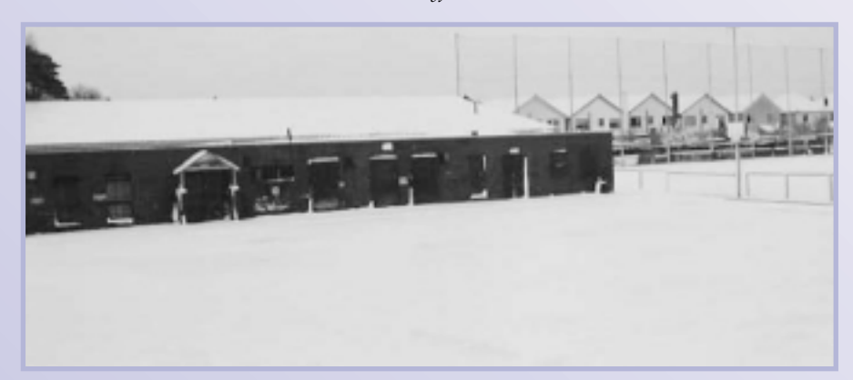
Páirc Uí Mhurchú