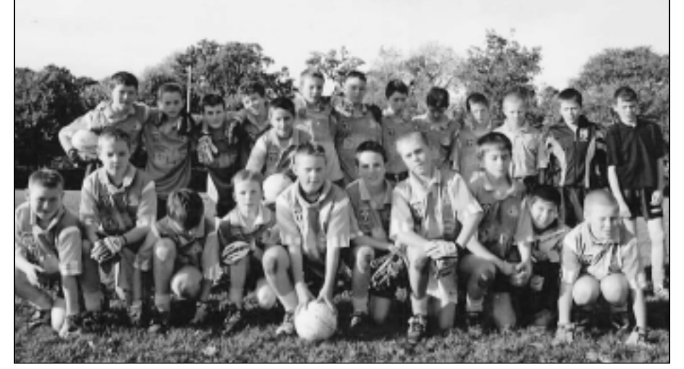
Corn Kitterick Winners - St. Marys BNS - Rathfarnham

On an extremely windy day, St. Mary's held out well against the conditions in the first half to be only trailing by two points at half time, 1-1 to 0-2. The second half was vintage Mary's however as the team really turned on the style and ran out eventual winners, 1-10 to 1-1. The Corn an Cheid was on its way to Rathfarnham.