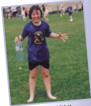
Wet! Wet! Wet!