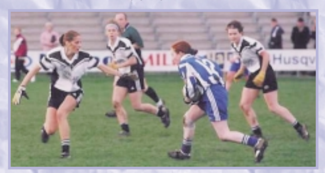
All-Ireland Final in Birr v Donoughmore