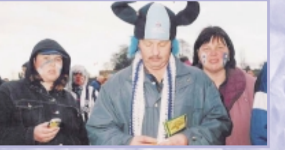
Viking Centre? Just off Dame Street Folks . . The Curtis Family going back to Dublin's Roots.