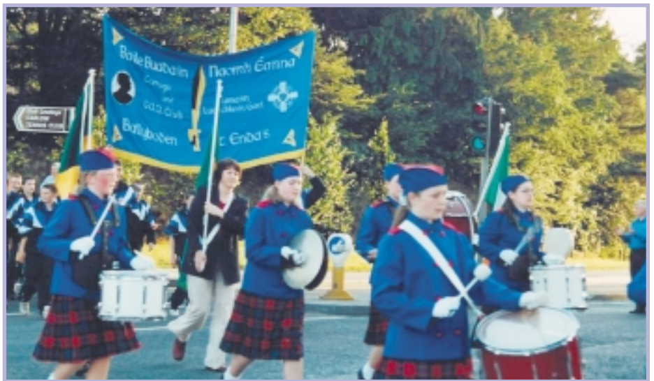
Under-14 Footballers lead Féile Peil Parade into Dr. Cullen Park, Carlow