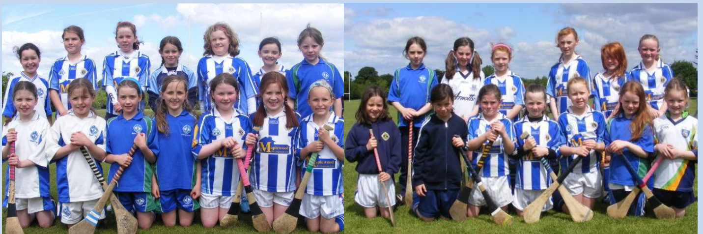
Above: Team pictures from the U-9 game vs. Good Counsel