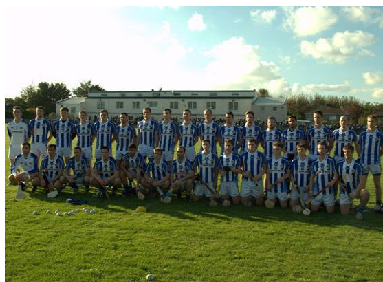
Junior A Final