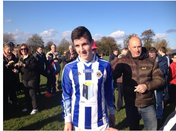
U 15C footballers wait for their medals after a gallant defeat to Cuala in the U15 d shield final