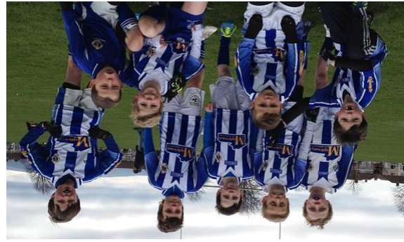
BBSE U9 Go Games Team Limerick v Crumlin Pearse Park, Crumlin.