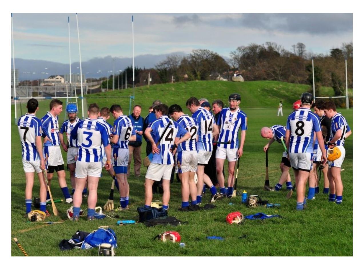
All 4 Adult hurling teams were in action for the second weekend running. This was the last round of games before the Championship, which start at the end of April.

The Senior A team were always going to have a difficult outing in Kilmacud as the Champions of the last two years met. Both teams were boosted by the return of the County players. The game finished a draw. Their next meeting will be in the last game of the Championship Round Robin series. A full report is available on grassrootsgaa.ie or by clicking the Hurlign page of the website.