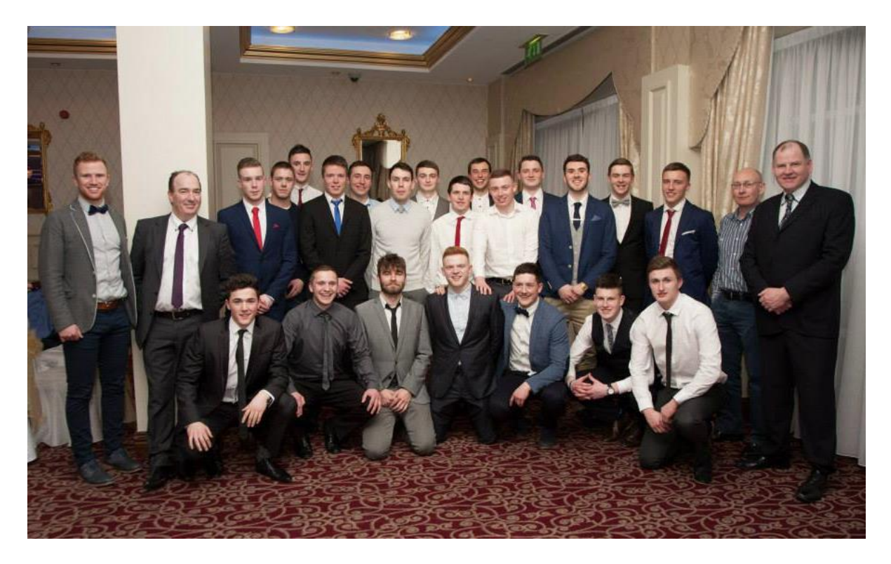
(Under 21 Football Championship Runners-Up)