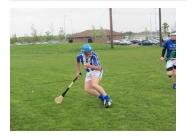
Islandbridge on May 11th.

He is also working towards his PhD in change of direction biomechanics and developing muscle and tendon loading protocols used in injured athletes.