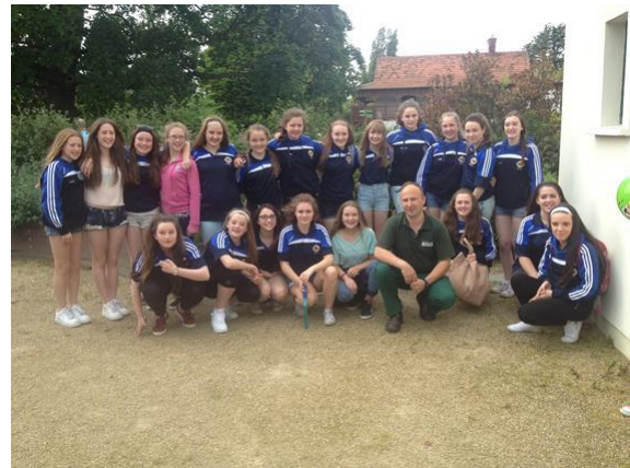
U14 girls visit Dublin zoo