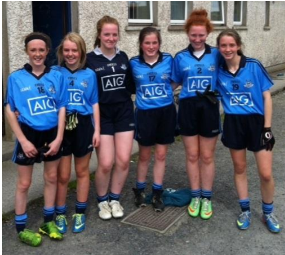
U14 Boden Dubs Stars