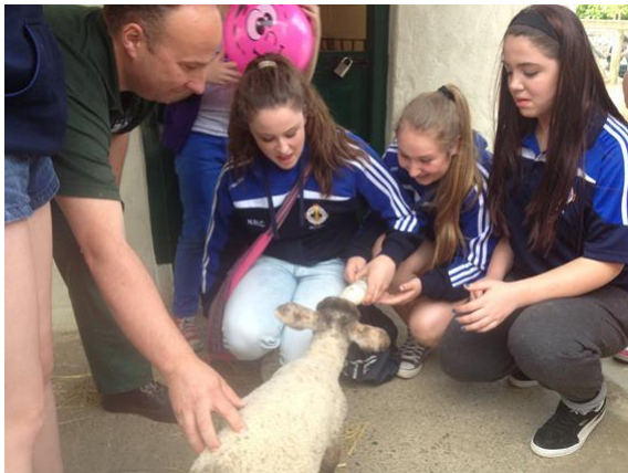
U14 girls visit Dublin zoo