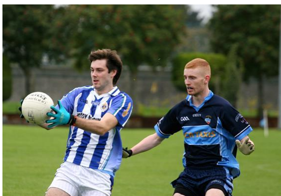
Inters V Judea