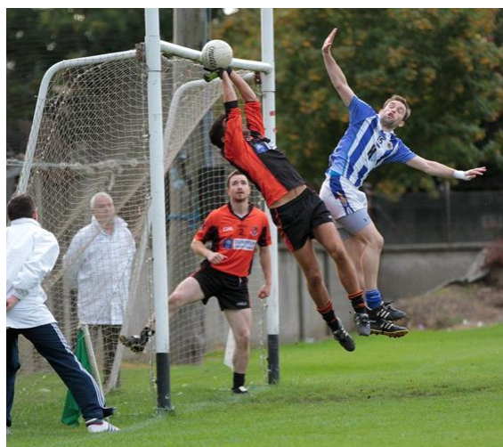
Seniors V Ballinteer