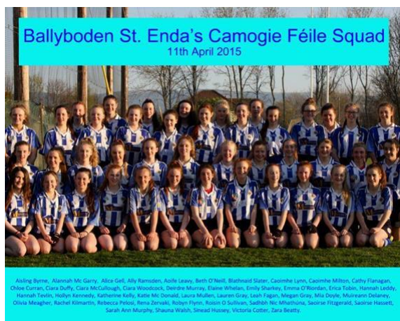
The Under 14 Féile Squads A and B Teams.