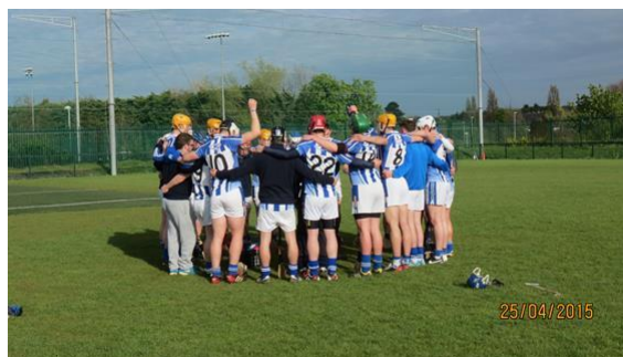
Sen B V Mearnóg