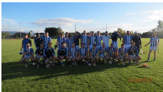
Sen A V Crumlin