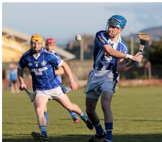
D OC V Crumlin