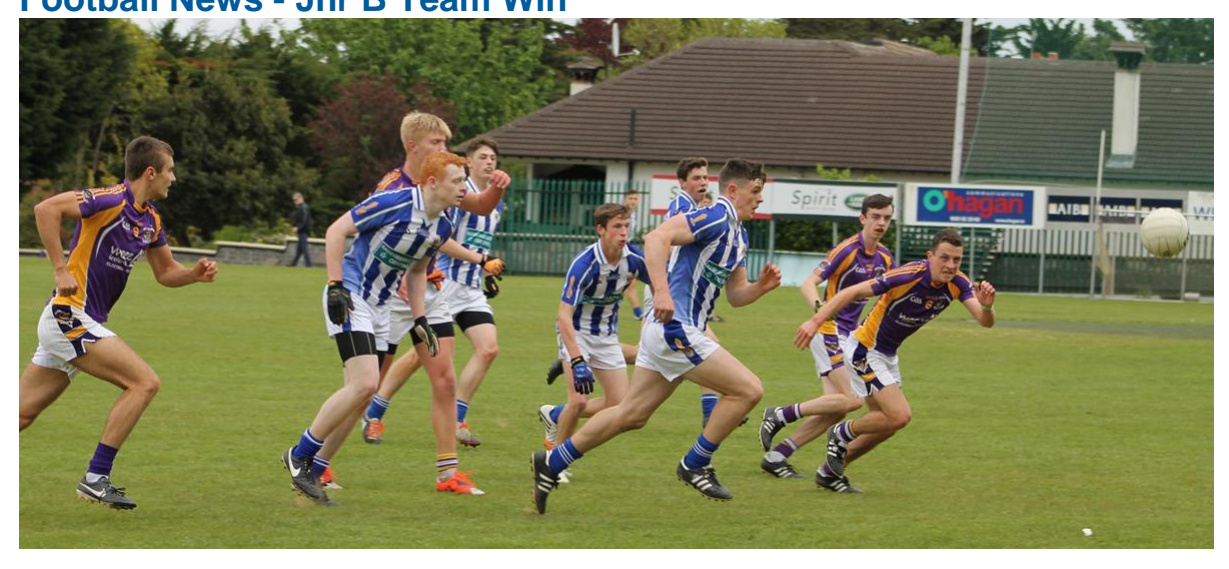
"all eyes on the ball"