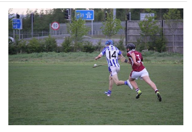
Feile Peil na nOg, Under 14C Team