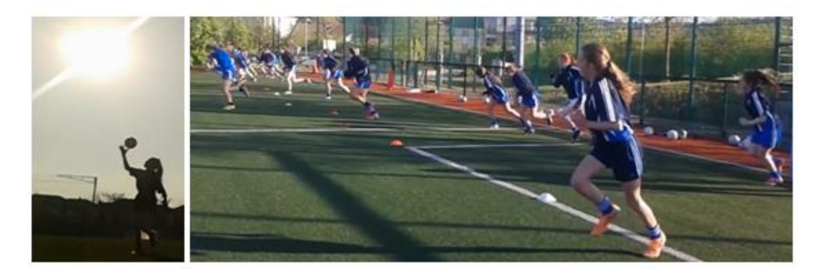
The first virtue in a soldier is endurance; courage is only the second virtue. Napoleon Bonaparte

The Under 16 ladies squad faced their toughest challenge yet with a test of endurance and determination that would bring most teams to their knees. Boden played against a very strong wind in the first half and scored well bringing the half time total to 7-06 to Naomh Marnog's 1-00. However, facing that wind in the second half meant that the girls would have to dig deep and support each other with every fibre in them in order to give themselves a chance. Naomh Marnog got on the scoreboard immediately and a flood of goals and point were delivered against the Boden girls. However, as with the character of these girls, giving up is never an option. Each and every one of the team squad poured everything they had into the game with the final result coming in at 7-12 to 7-06 in favour of Boden. They know that if they give it their all, then they will always be in with a chance. The endurance of the U16 Boden girls, the determination of the U16 Boden girls and the talent of the U16 Boden girls is what defines them. And as for courage – well that's never in doubt!!