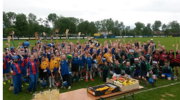
3rd Clacc Camogie Blitz