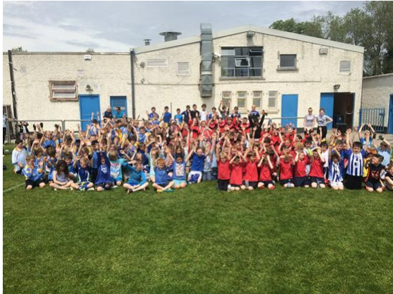
2ns Class Football Blitz

Thanks to the 10 young club players who helped in the organising and refereeing of the matches, to the teachers in organising the teams and the parents who came to support the children!!