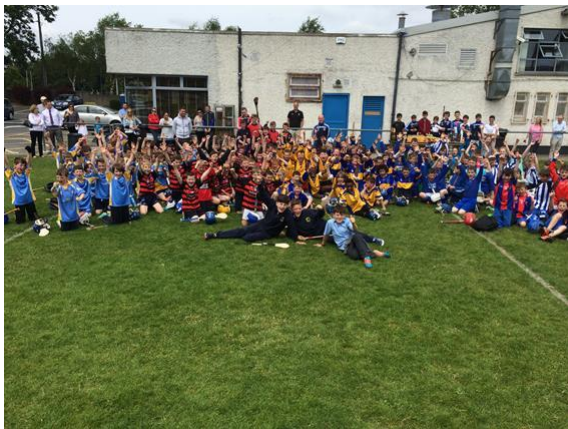
3rd Class Hurling Blitz