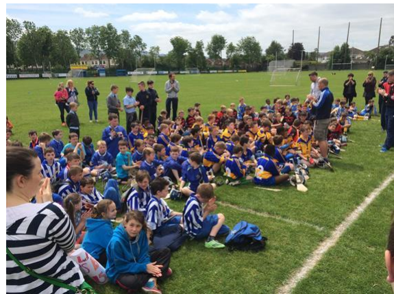
3rd Class Hurling Blitz