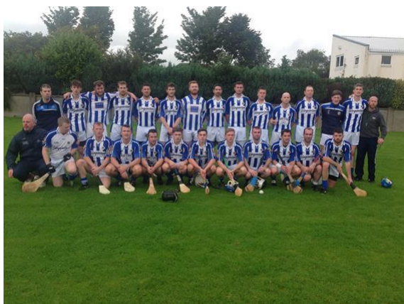
Junior C Champions