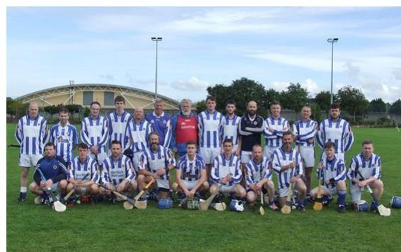
Junior E Champions