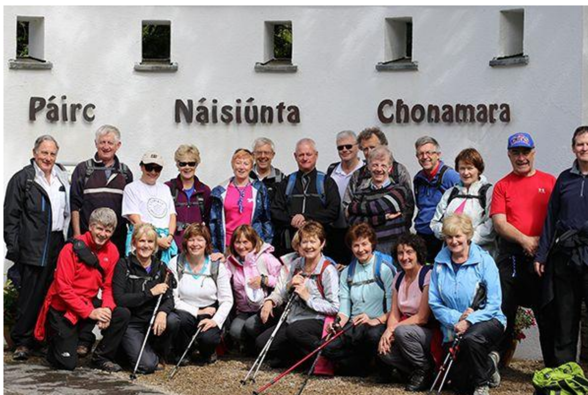
Na Siúltóirí Buadáin on their recent trip to Conamara - Day 1 Diamond Hill near Letterfrack