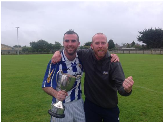
Keville Boys !!!!