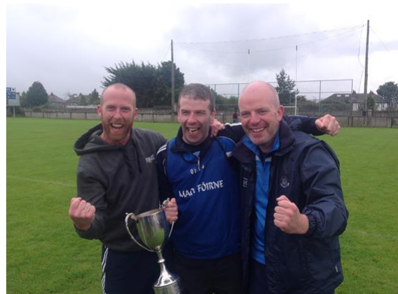
The Three Amigos