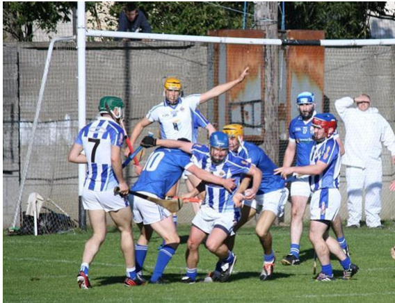
This way Mal !!!!!