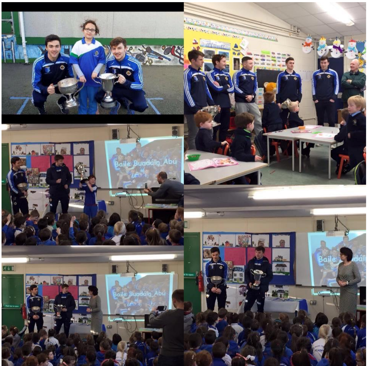
Gealscoil Chnoc Liamhna