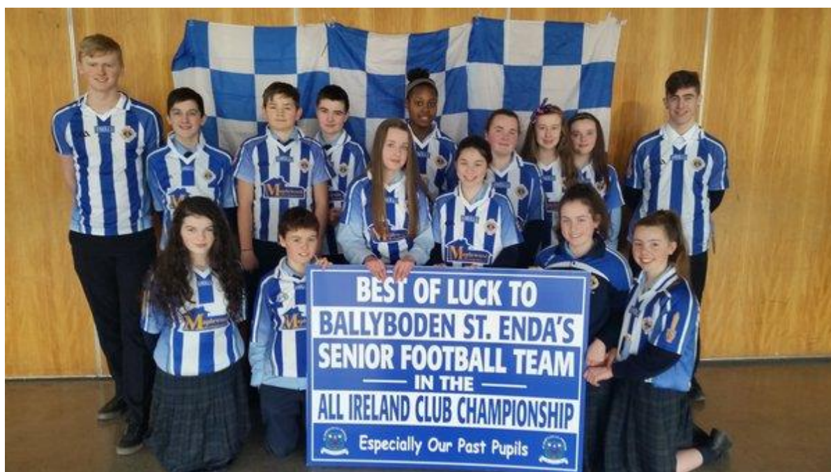
St Colmcilles Community School