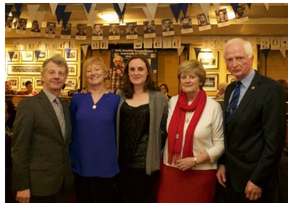
Group 2 (l-r) At the Oíche Seolta launching the Club's Programme of Events to