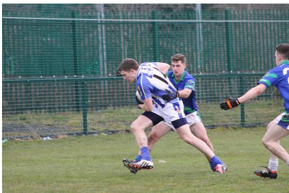
BBSE Inter FB v Sylesters Prunty