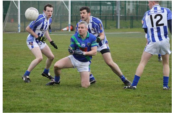
BBSE Inter FB v Sylesters Prunty