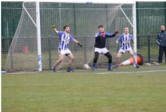
BBSE Inter FB v Sylesters Prunty