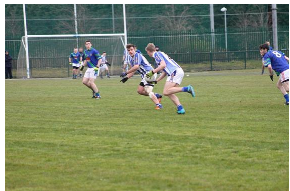
BBSE Inter FB v Sylesters Prunty