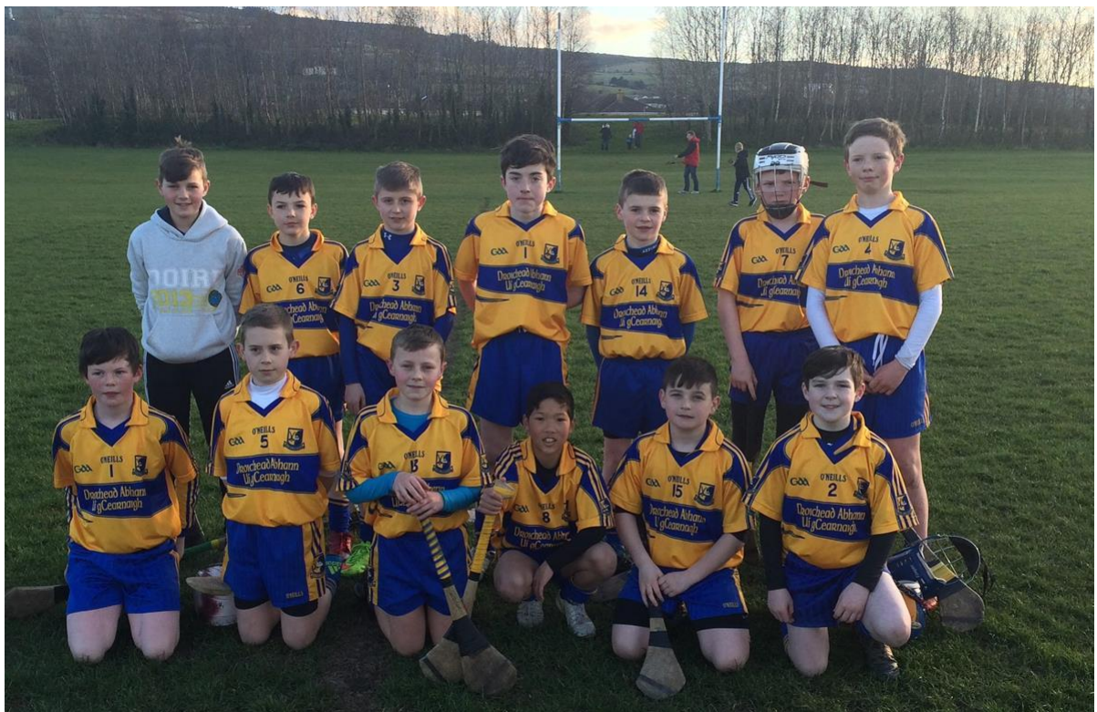
Sixmilebridge U12 Hurlers