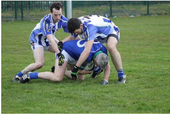
BBSE Inter FB v Sylesters Prunty