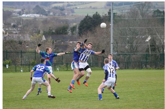
BBSE Inter FB v Sylesters Prunty