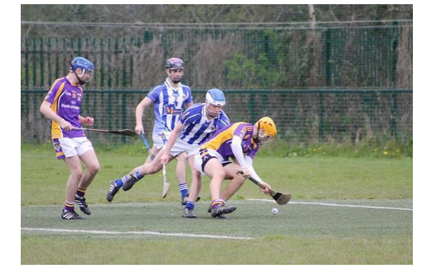
Minor A V Kilmacud Crokes