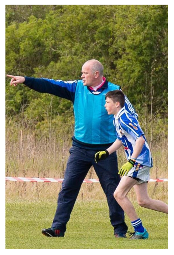
Feile Peil na nOg BBSE U14C Division 8