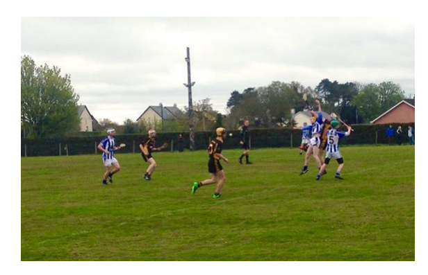
Minor C V Wild Geese