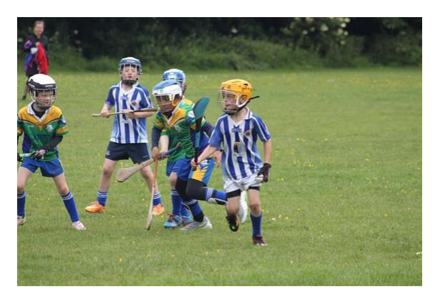
U12 (Div 11) Ballyboden St. Endas 3-4 V Lucan Sarsfields 6.4