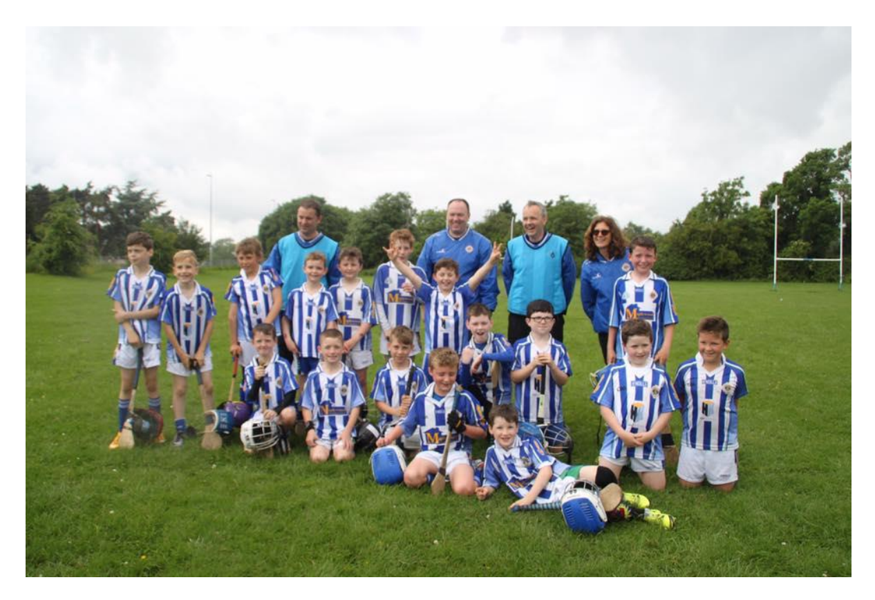
The U9 Feile was on Sunday June 12th. The day did not start too promising from a weather perspective with heavy rain and thunderstorms throughout the previous night. It was an early start for the Boden mentors, but as they arrived at Cherryfield, the rain began to clear and soon preparations were well advanced in the pitches and in the hall.

By 10am some 120 players and circa 200 supporters had gathered to watch the games and they would not be disappointed with the hurling that would be served up in the Knocklyon Tournament and the Rathfarnham Tournament.