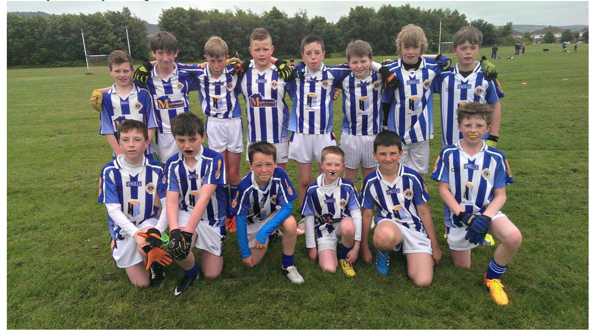
Ballycullen – June 18th