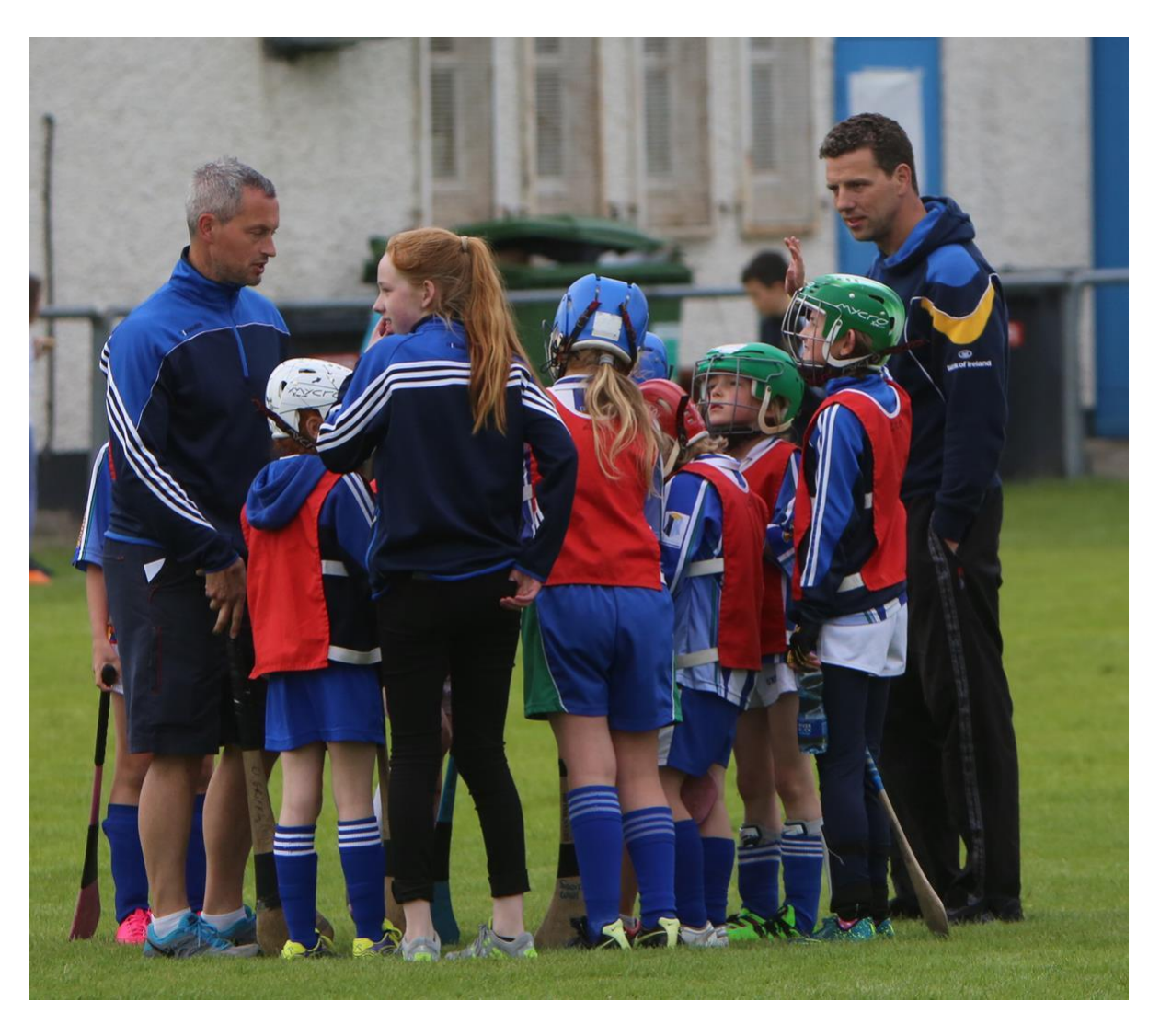
Click here for the rest of the terrific photos of a great evening enjoyed by all.