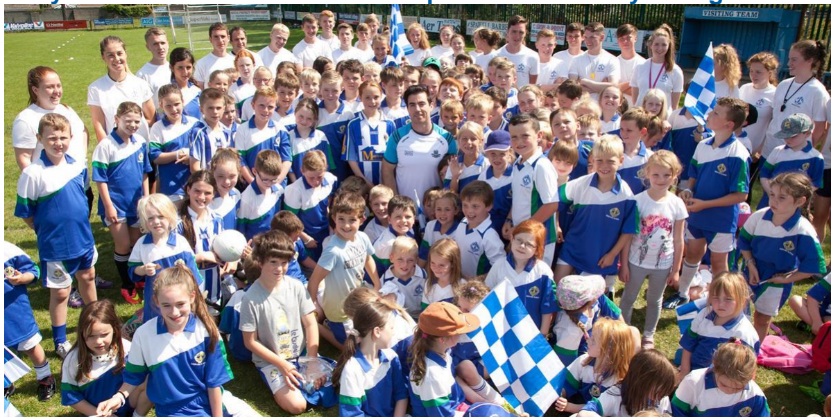
Summer Camp time again!!...Ballyboden St Enda's Summer Camp returns this July & August!!

Ballyboden St Enda's Summer Camp returns this July & August!!