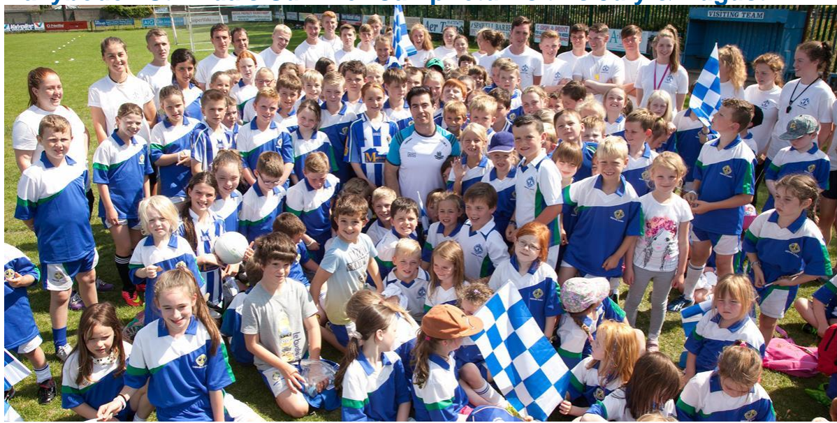
Summer Camp time again!!...Ballyboden St Enda's Summer Camp returns this July & August!!

Ballyboden St Enda's Summer Camp returns this July & August!!