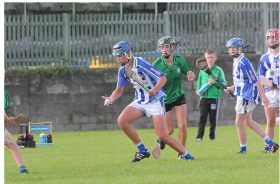
U12 Footballers host Wolfe Tones of Armagh.