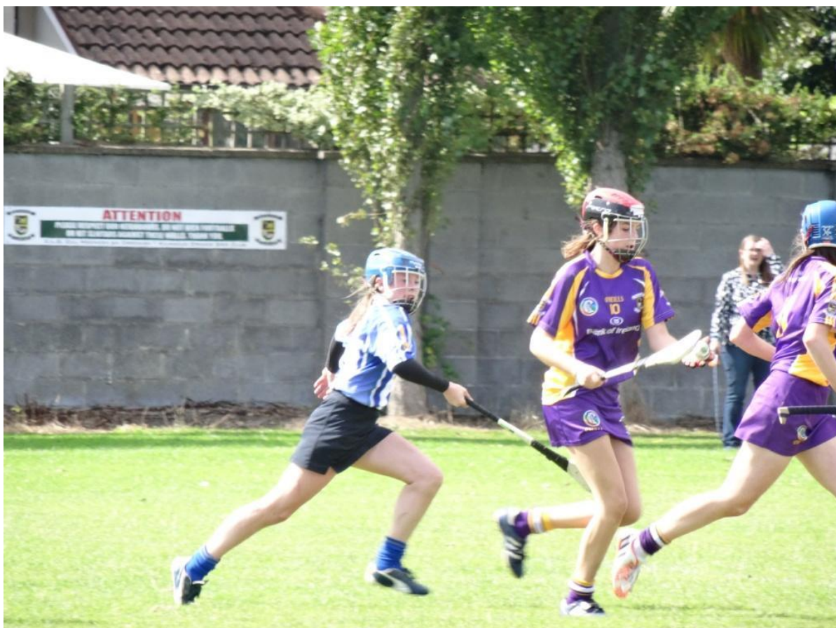
Knocklyon u14 Girls Gaelic Football - National Runners-Up