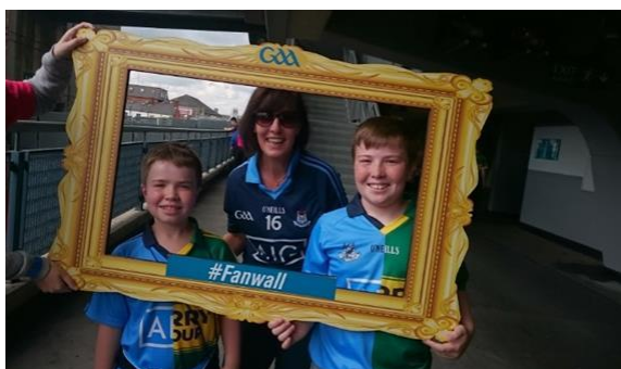
O Donoghue Family