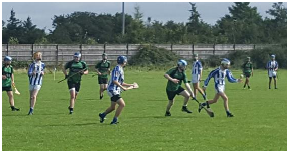
Minor D V St Pats