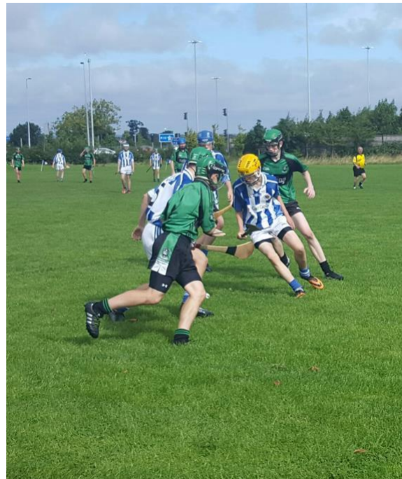
Minor D V St Pats