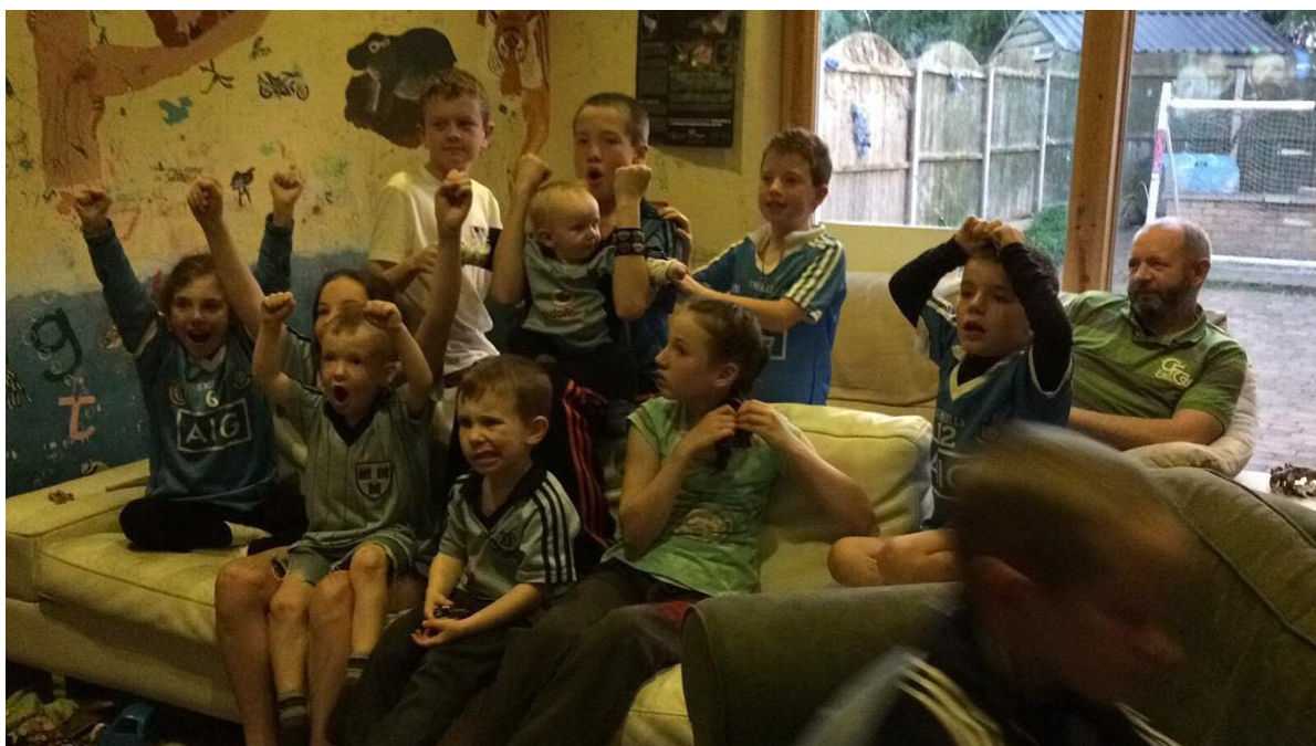
Baile Buadáin Ó'Dalaighs celebrating Dubs win with their Cousins the Naomh Olaf Nic Coitirs