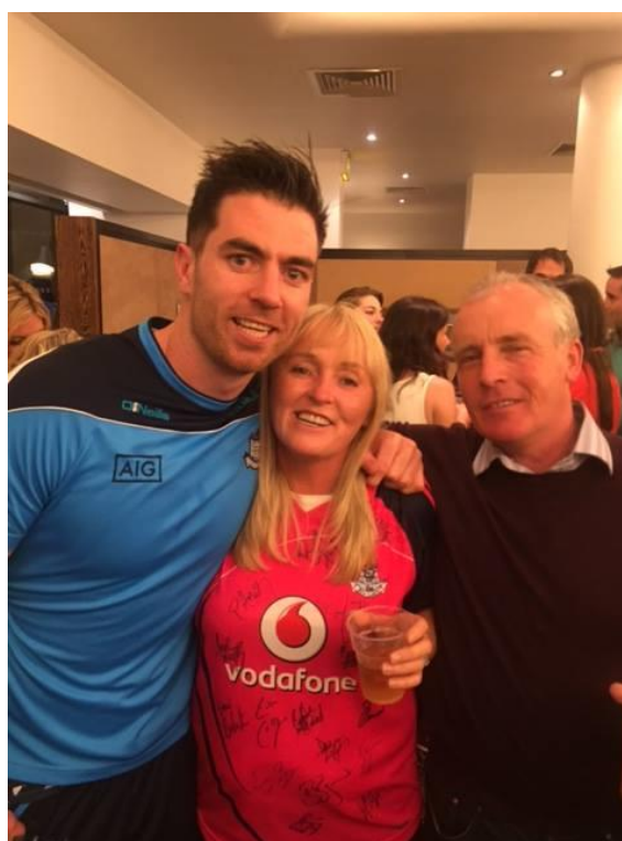
Ballyboden St Enda's celebrating the All Ireland Final win in Photos..