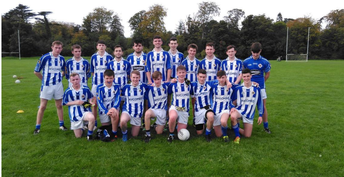
Minor C team 2016