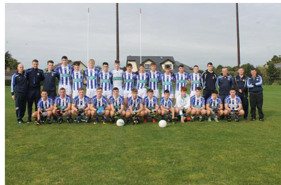
Minor A team 2016 - click here for more photos