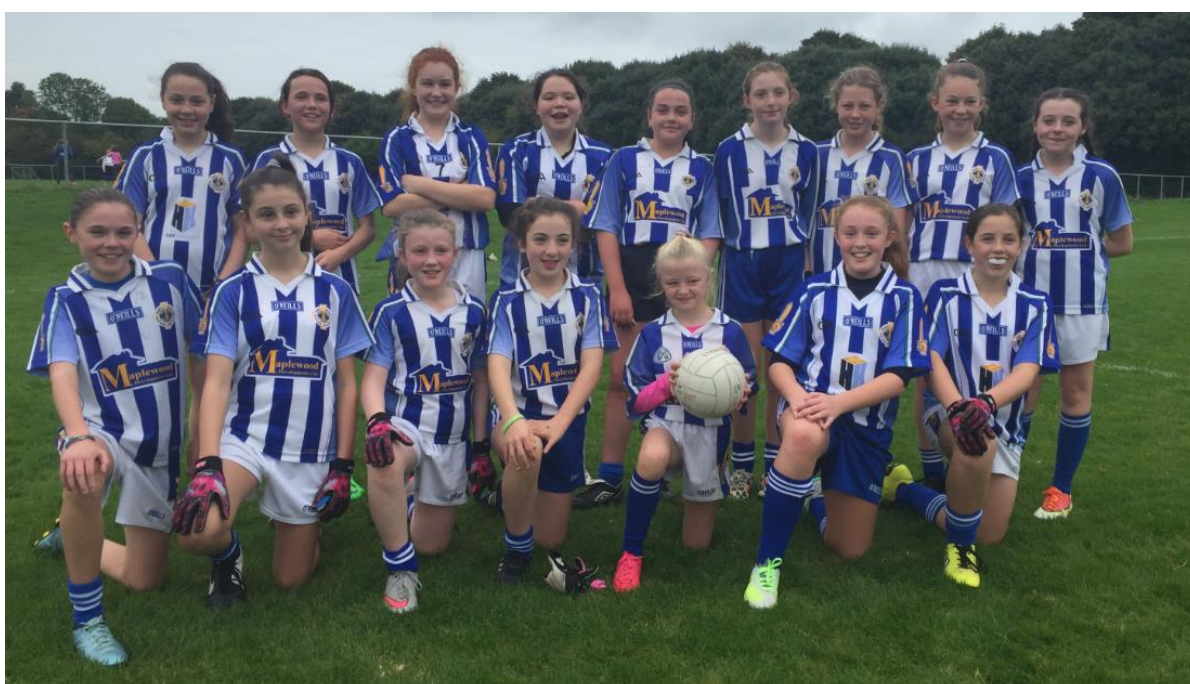
One of the under 12 teams who continued on their winning ways against Clontarf last Saturday