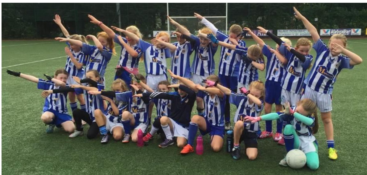
And they had a yabbah "DAB" do performance