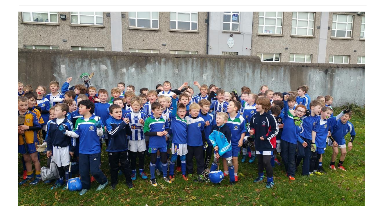
Club Calendar 2017