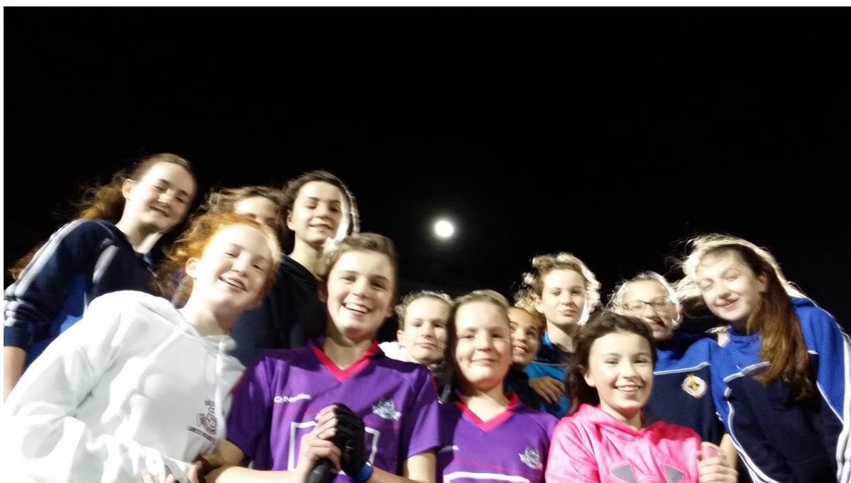
Members of our U13 Camogie panel at training on Super Moon night, 14th November 2016.