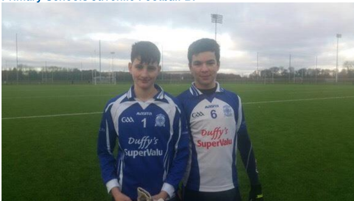
In an absorbing match in the GAA's new National Games Development Centre at Abbotstown, the boys won with a scoreline of Colaiste Eanna 6-09 St Declans 5-11. The team is made up predominantly of U13 and U14 players from Ballyboden.