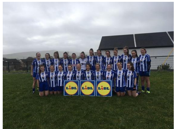
U 13A Ladies footballers