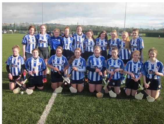
Ballyboden U16B Camogie team