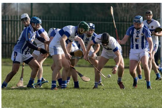
Vincent's win a scramble for possession