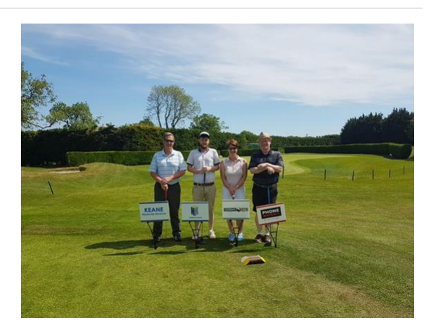
Cruinn Diagnostics 2 Team