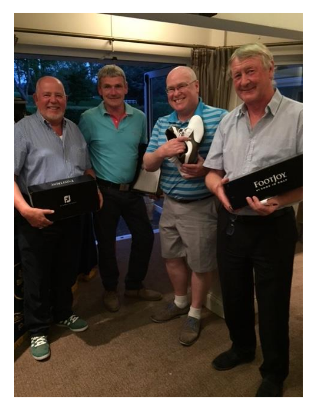
Greenoak Construction Team (2nd place)