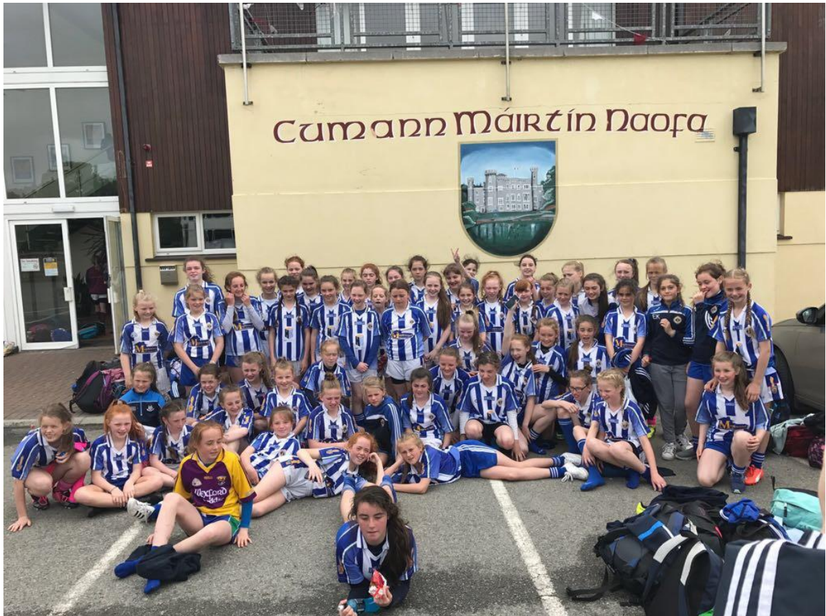
The U12 girls travelled to play football in St Martins GAA Wexford on Sunday. 62 girls travelled on the day. They finished the day out with a fabulous meal and disco compliments of Darcy McGees in the Spawell complex.