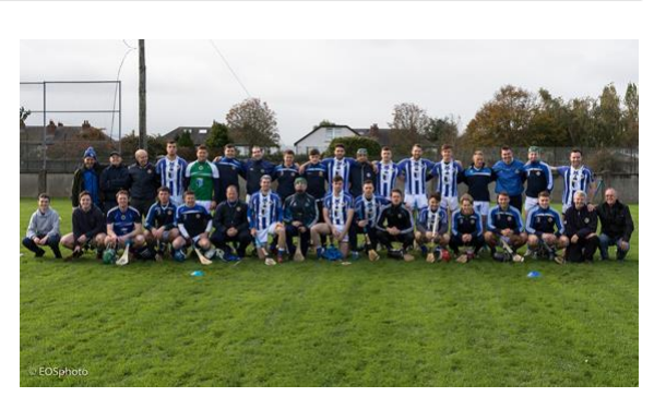
Senior Team line up before their League final against Brigid's