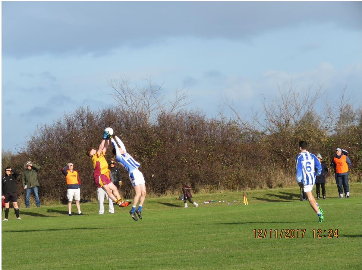
Minor C Football Championship Final. Boden 0-13 Craobh Chiarain 2-8