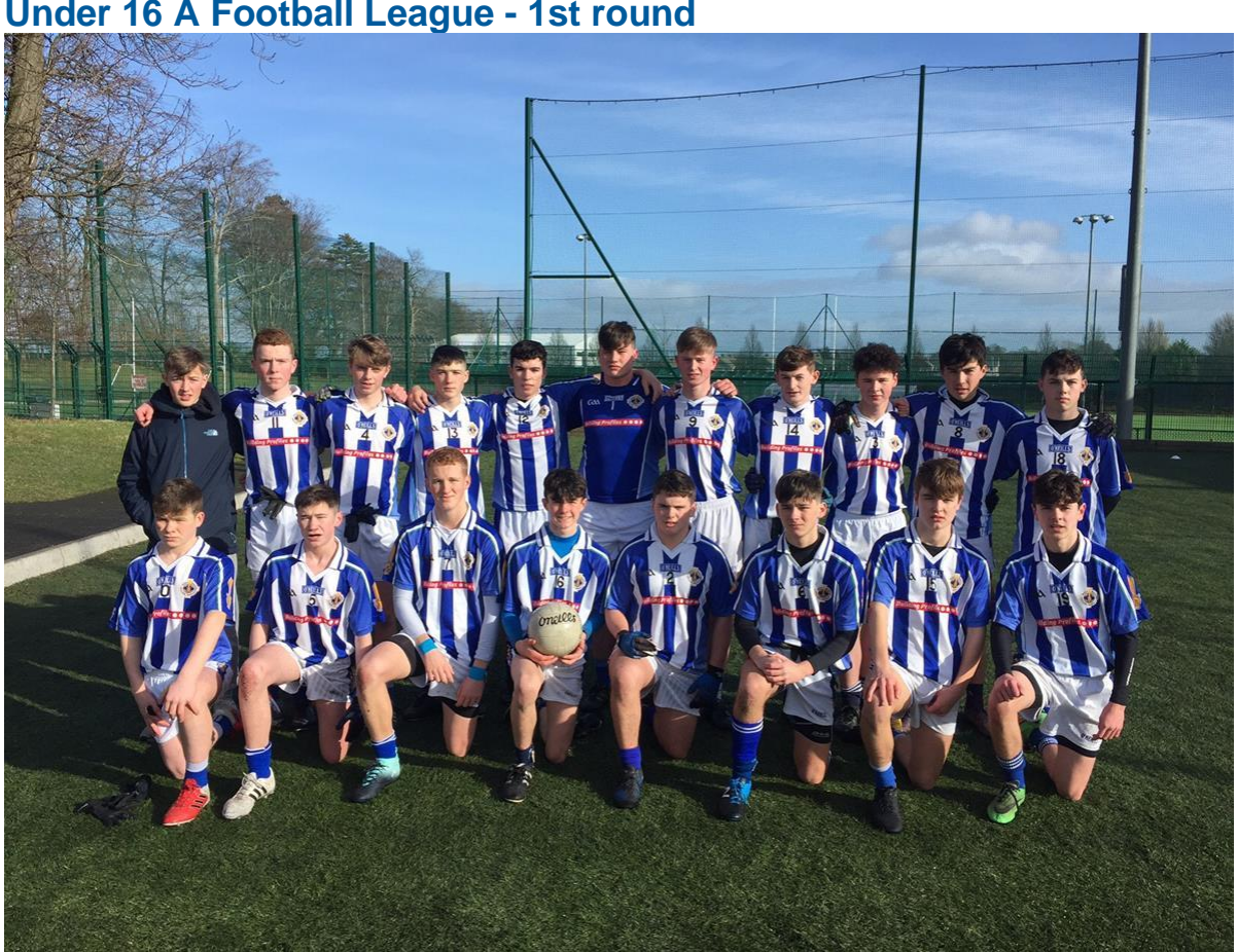
Under 16 A Football League - 1st round

Our U16A Footballers kicked off their League campaign last Saturday with a win. Our local scribe was on hand to report on the proceedings!