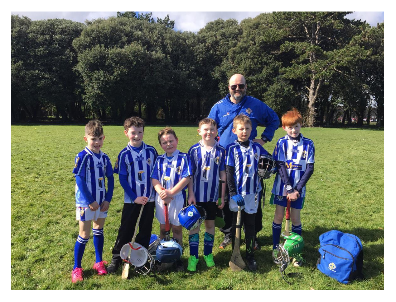
Some of our U10 Hurlers travelled to St Anne's Park last a Saturday to take on Naomh Barrog.

A great day was had by all and the lads put the shoulder to the wheel and played great. Well done boys!