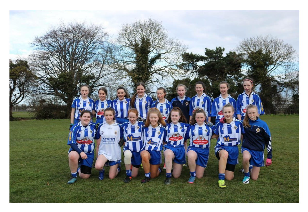
Our U16C Ladies had a great start to their Football League campaign last Sunday when they had a very comprehensive win over Beann Eadair in Cherryfield on Sunday.