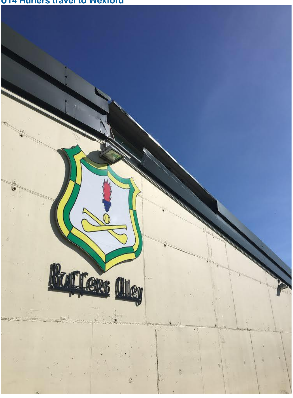
U14 Hurlers travel to Wexford

On Sunday morning, the Under 14 Hurlers travelled to Buffers Alley in Wexford for a challenge game.