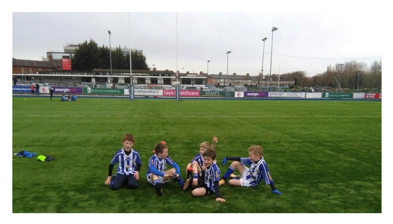
The U10 boys reflecting on their comeback of the season in their second half, a tremendous effort by all to draw the game, when they took on Ranelagh Gaels in Donnybrook Stadium last Saturday morning.