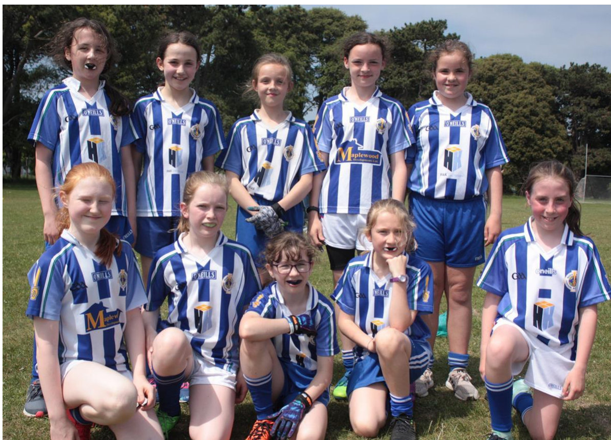
U11 FEILE IOMANA IN CHERRYFIELD