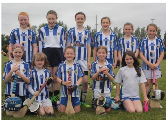
Under 11 Team 3