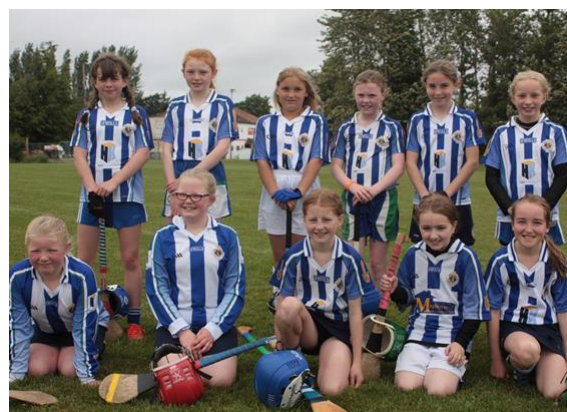
Under 11 Team 2