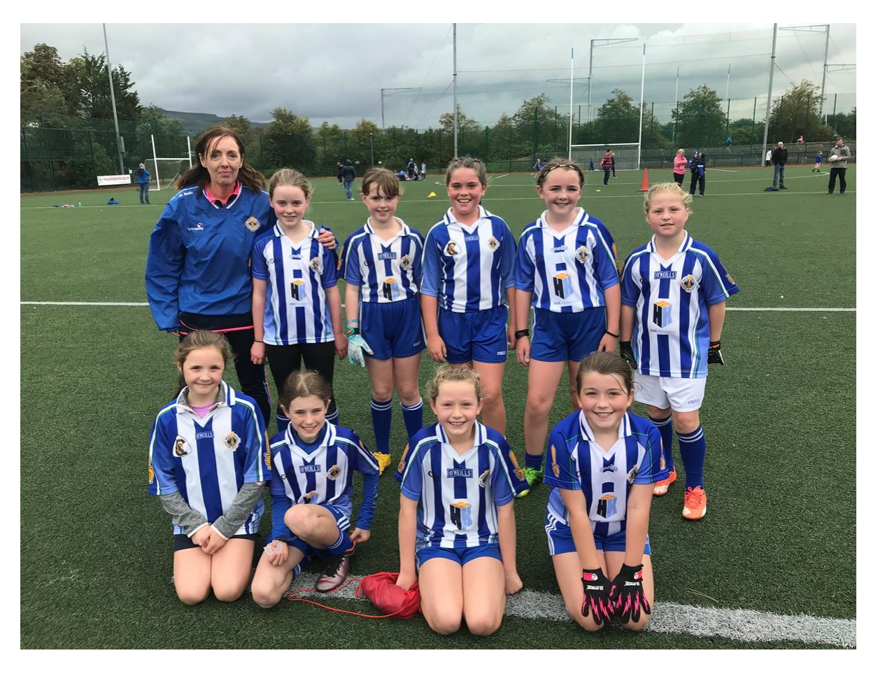
Our 4 U10 football teams were in Go Games action on Saturday, with 2 teams playing St Sylvesters in Sancta Maria, and the other teams taking on Cuala away. Four very enjoyable games took place with the girls putting in really strong performances. Well done girls!!