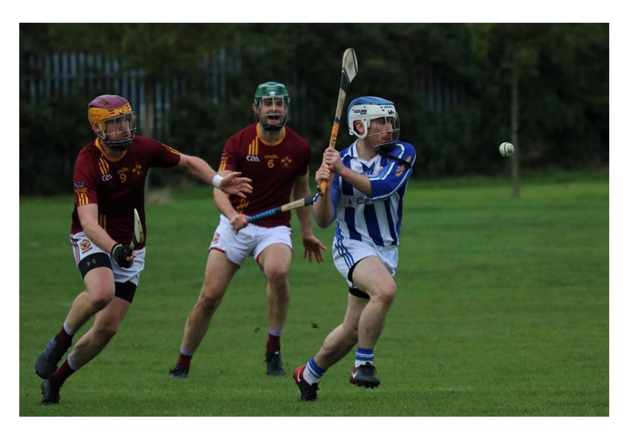
The Limrick Layder Reports from PUM