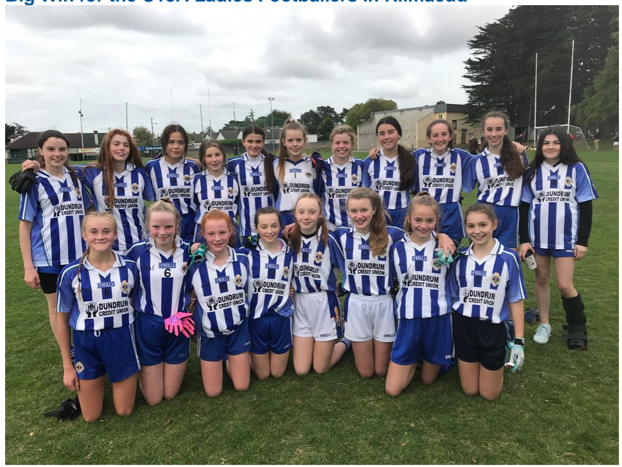
Our U13A girls played Kilmacud Crokes in the last round of the cup on Saturday afternoon at Pairc de Burca.

Big Win for the U13A Ladies Footballers in Kilmacud