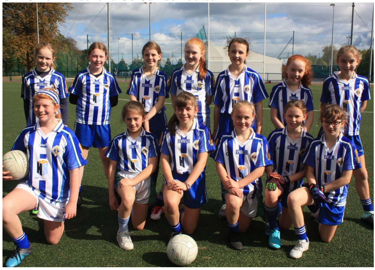
U11 Girls in Weekend Go Games Football Action

All five of our U11 football teams were in Go Games action this weekend, with the 3 team group hosting teams from Raheny at Sancta Maria, and our 2 team group travelling to Chanel to face Parnells on Sunday morning.