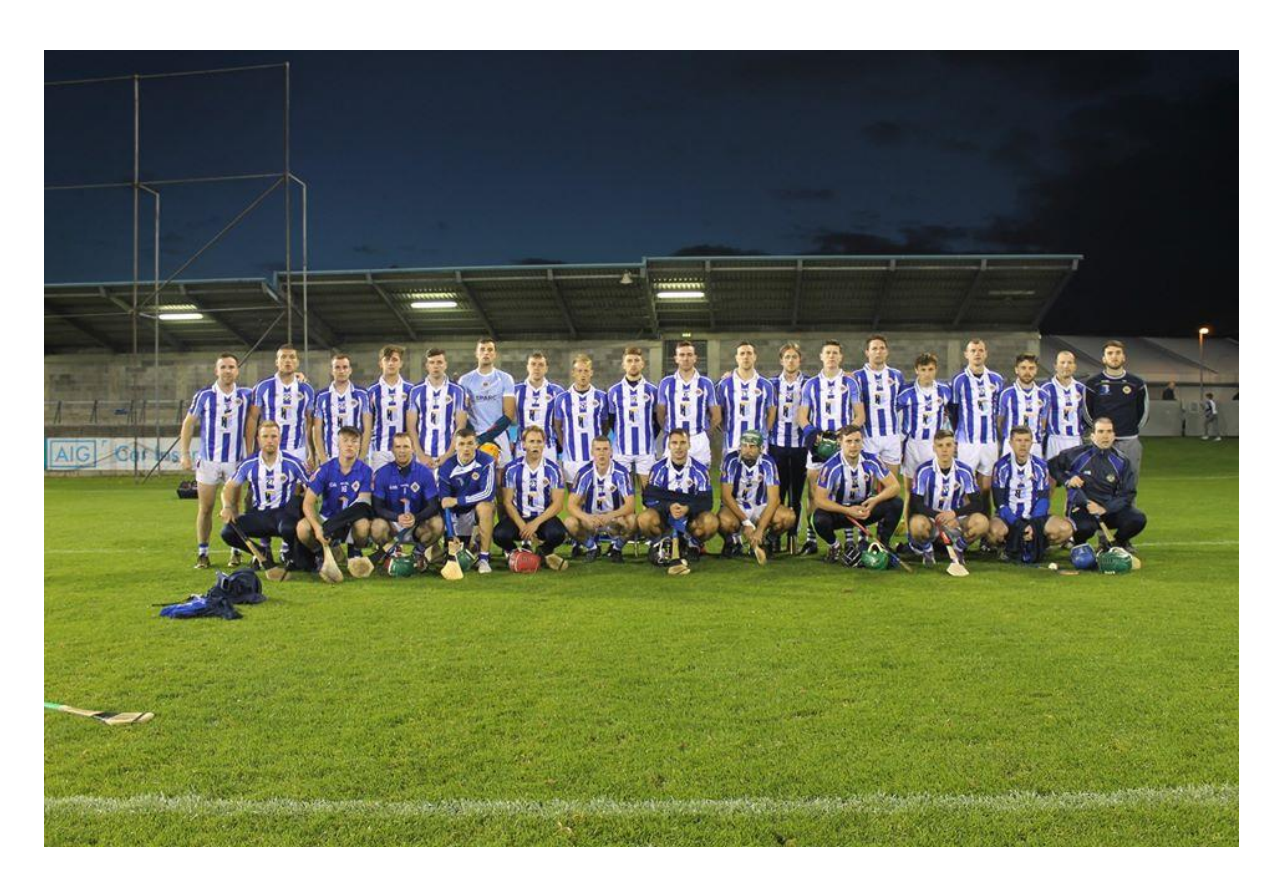
The Long Fella Reports

Ballyboden St. Endas 3 21 Ballinteer St. Johns 0 18