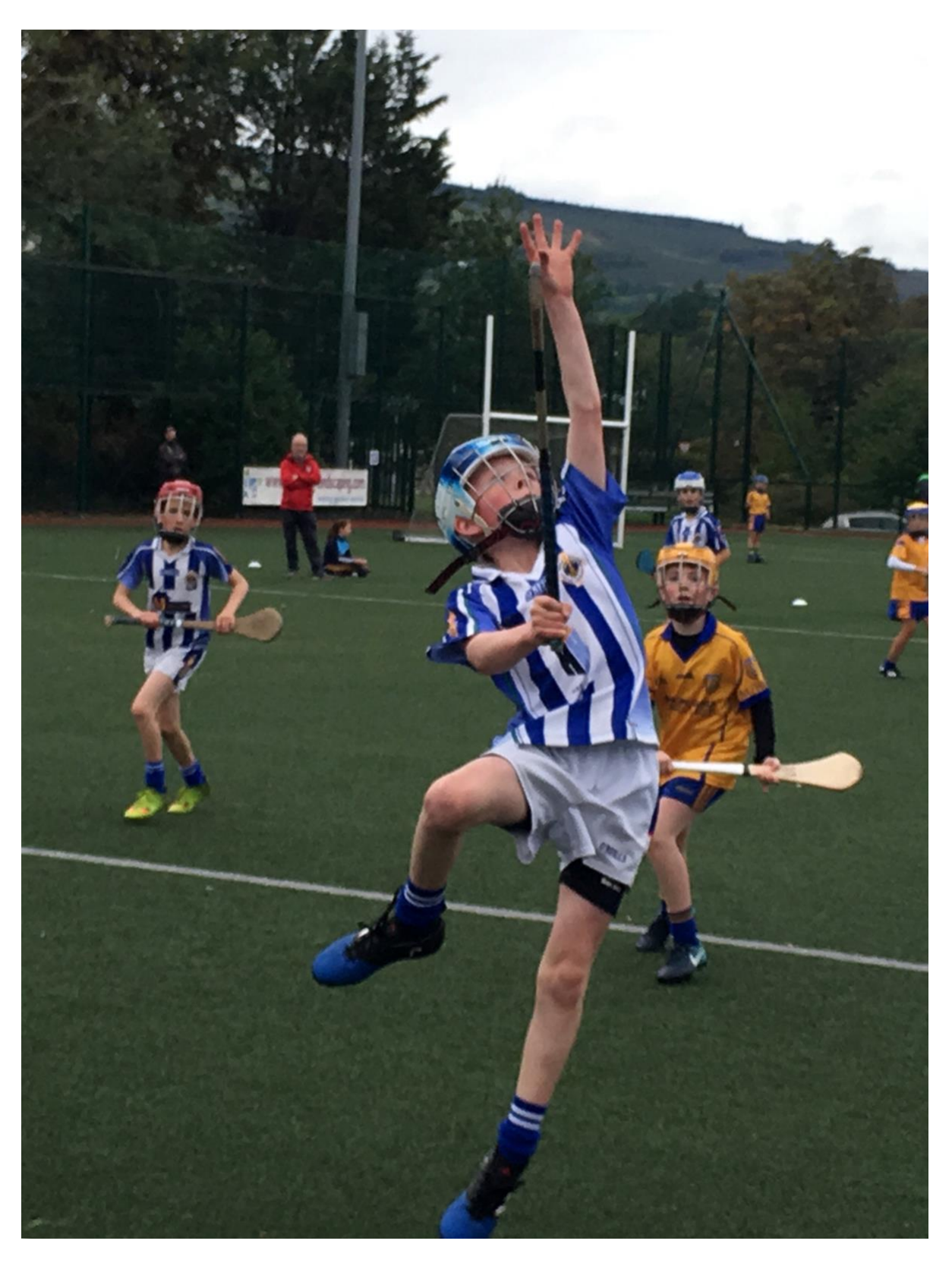
Some of the best shots of our under 10s in action against Na Fianna in their Group two encounter!