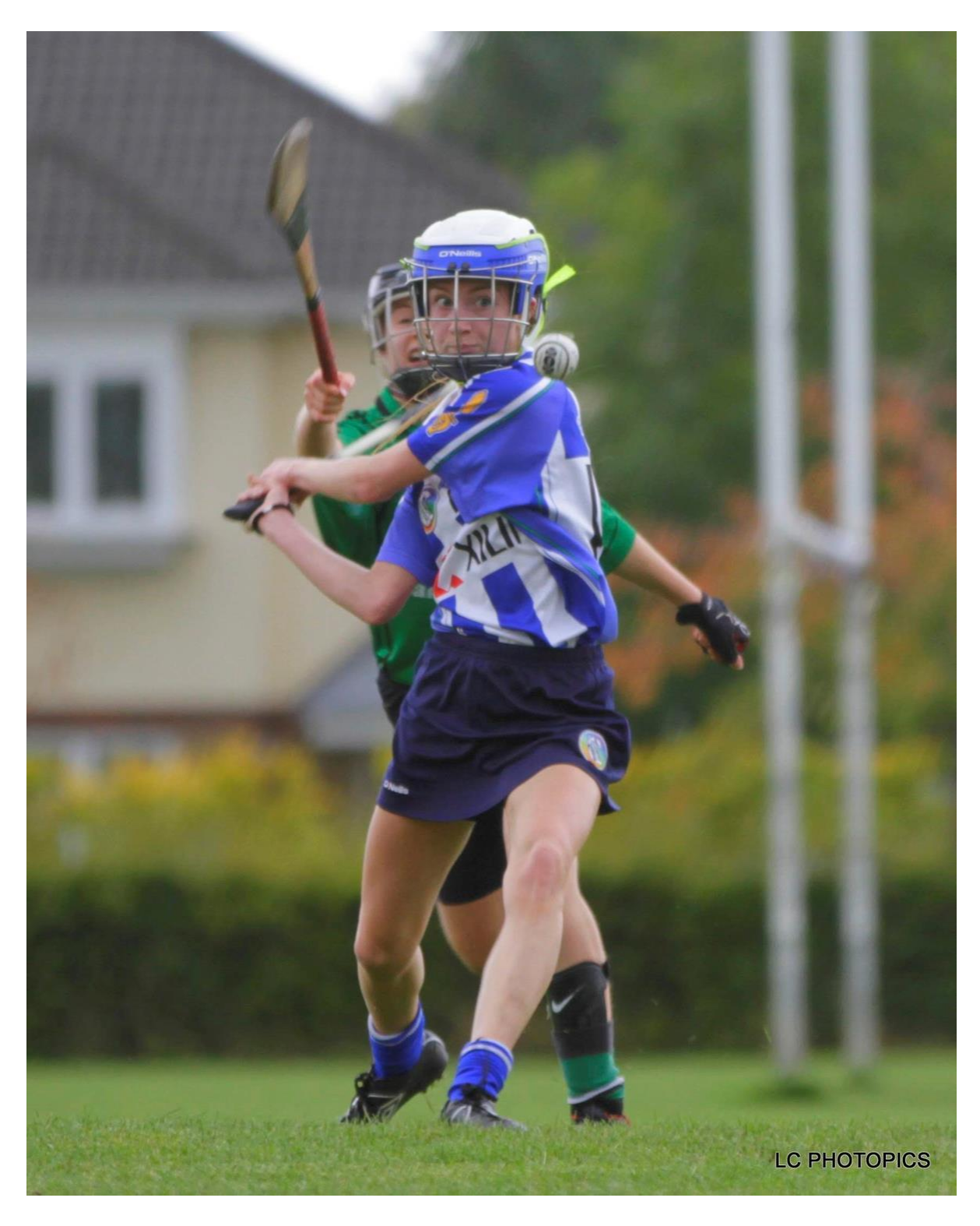
U-16 A Championship – vs. Lucan – 22nd Sept. '18 – Arthur Griffith Park