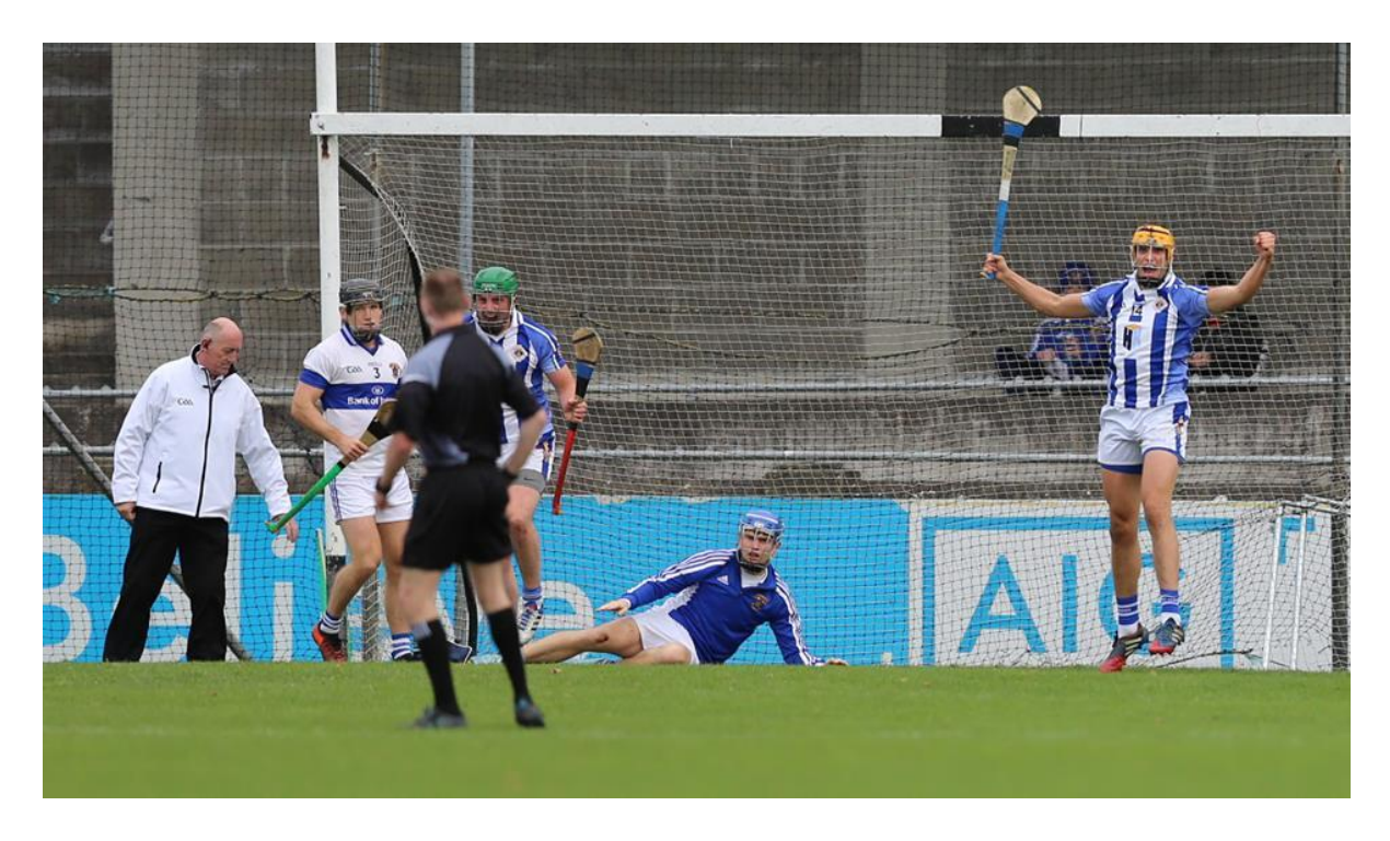
BBSE 2 16 St. Vincents 0 18