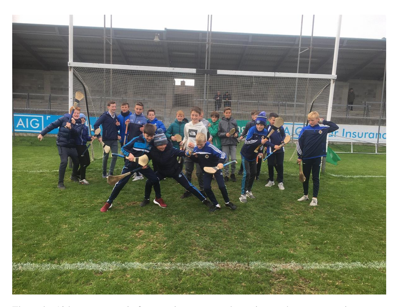
The under 12 boys were out in force again to support the seniors as they swept to victory against St Vincents in Sundays' semi-final.

Let's hope they can go the whole way and win the county final against Crokes! Whatever happens they should know they will have the full support of the younger lads who appreciate their brilliant skills and who hope to emulate their heroes in the years to come. C'mon Boden!