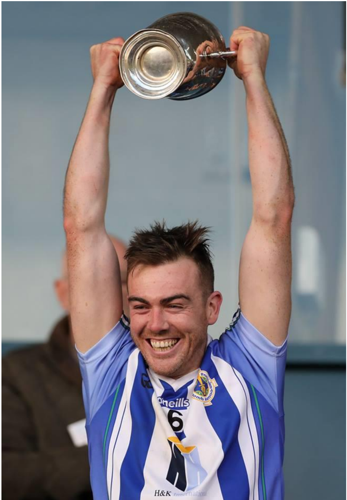
Steel of Fortune shines through in replayed senior final