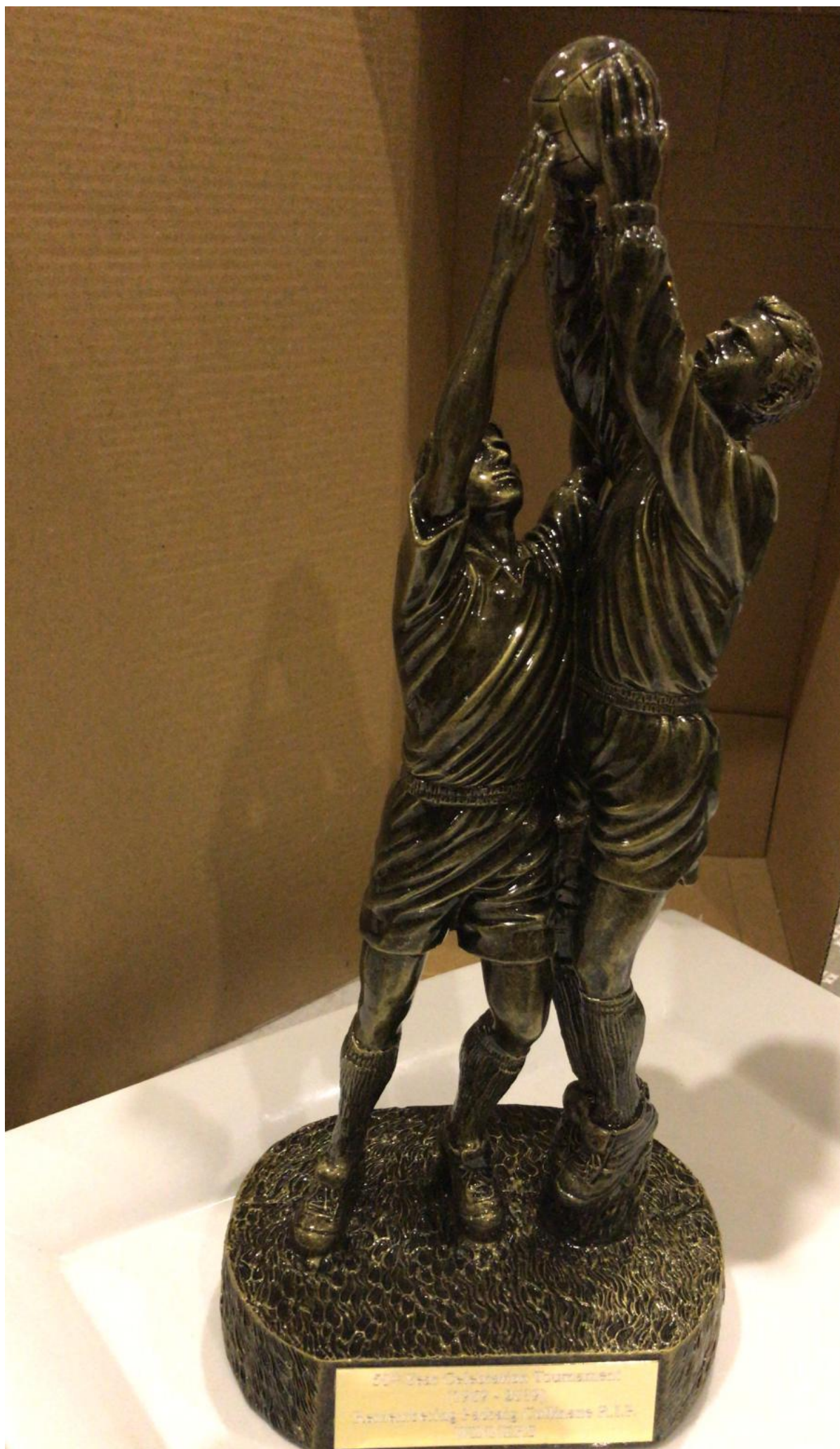
50th Anniversary Tournament 1997-2017 Sriwijaya Basketball Club P.S. 2017