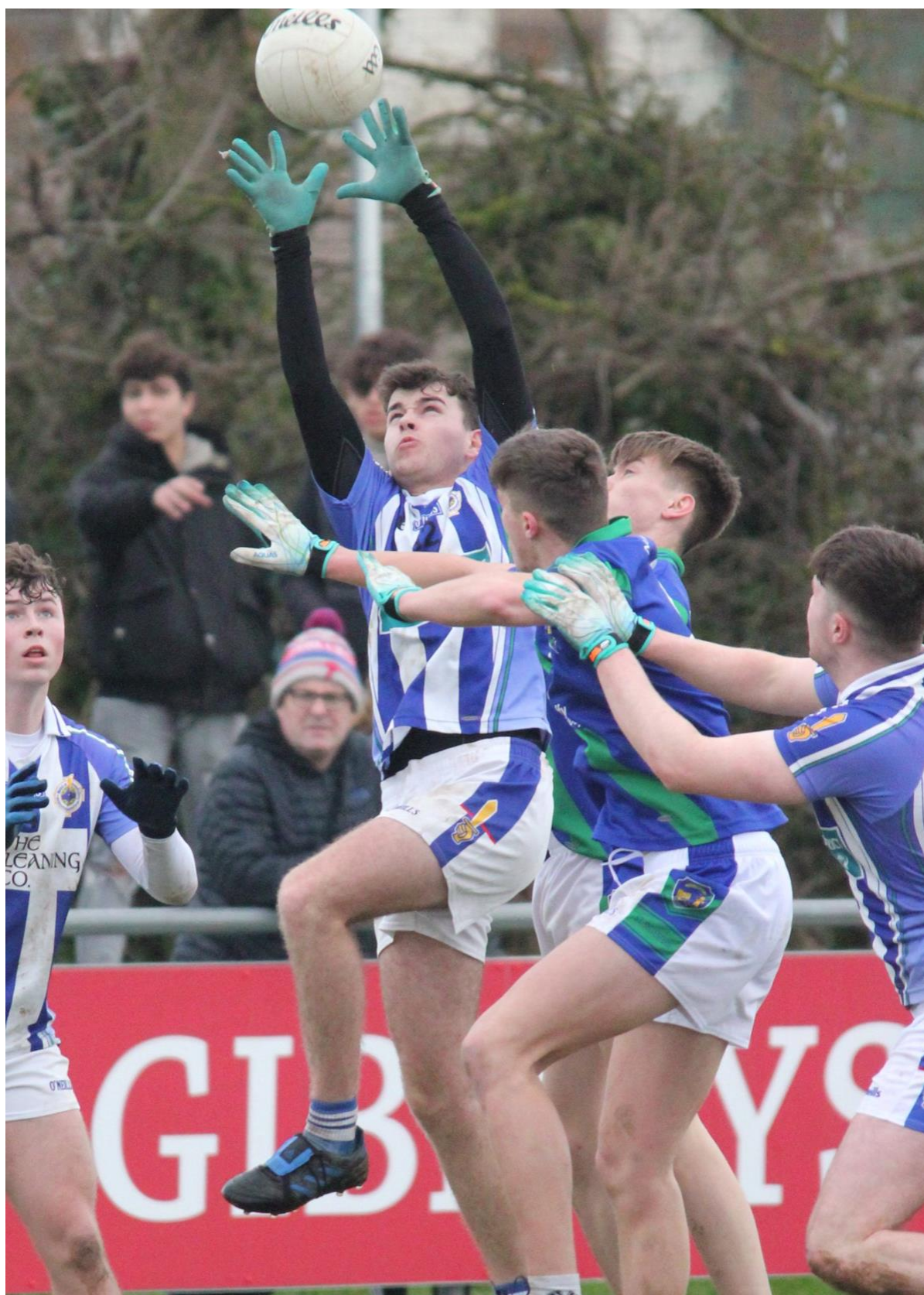
24/02/2019. Vs. St. Sylvesters. Venue: Broomfield.