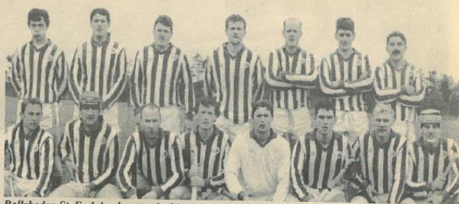
Ballyboden St. Enda's who marched into the second round of the I.H.C. last Sunday.