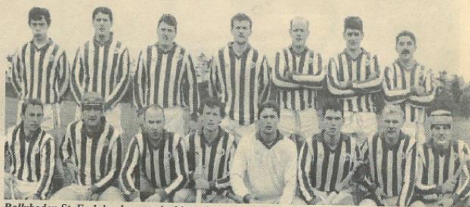
Ballyboden St. Enda's who marched into the second round of the I.H.C. last Sunday.