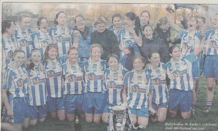
Ballyboden St. Enda's celebrate their All-Ireland success.

THE QUEST for the Holy Grail has finally come to an end for Ballyboden St. Enda's and Dublin ladies' football.