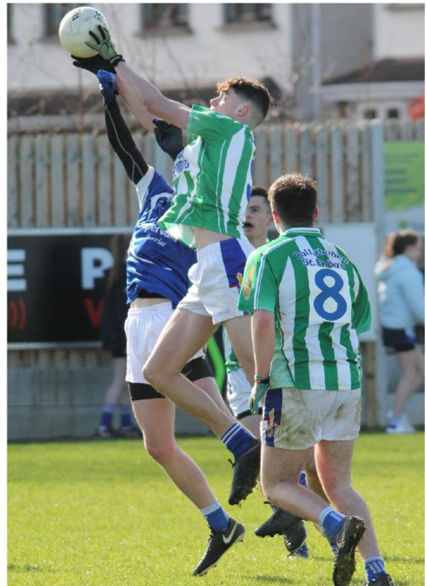
Minor Football. Division 1 League. 10/03/2019.