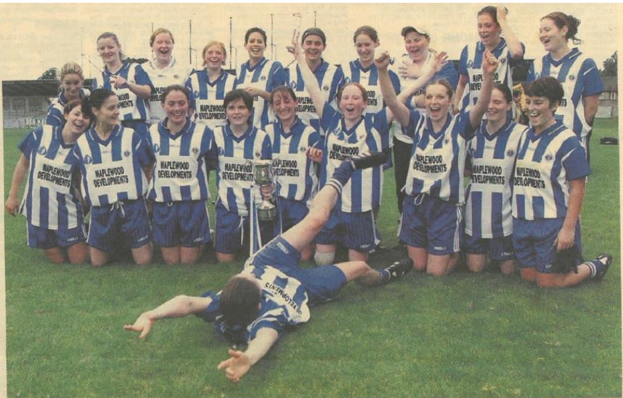
CHAMPS AGAIN!: Ballyboden St. Enda's celebrate after retaining their Dublin Senior Championship title at Parnell Park.