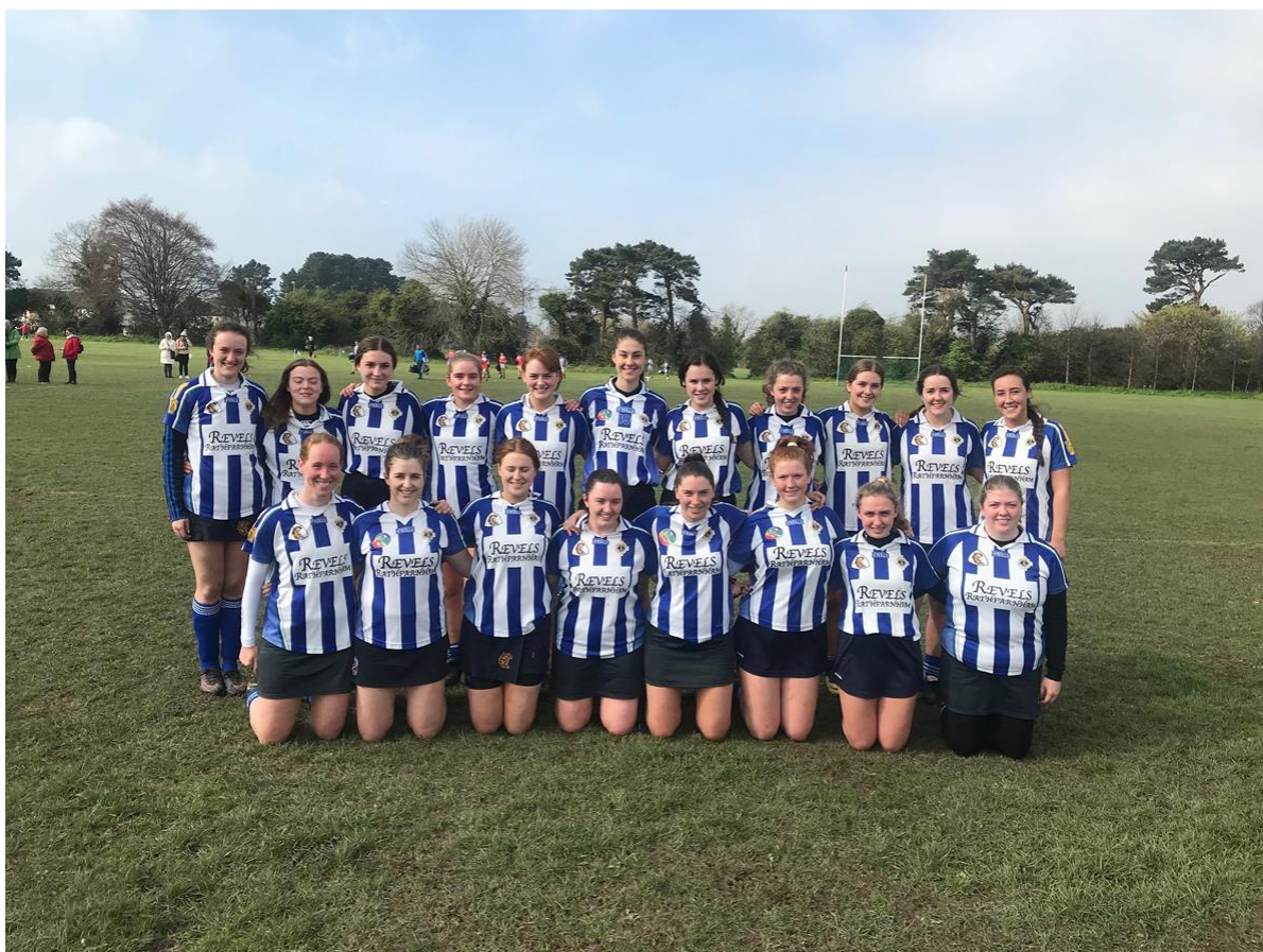
Senior B Camogie

Inter 1 League – BBSE 1-9 Naomh Fionnbarra 2-3