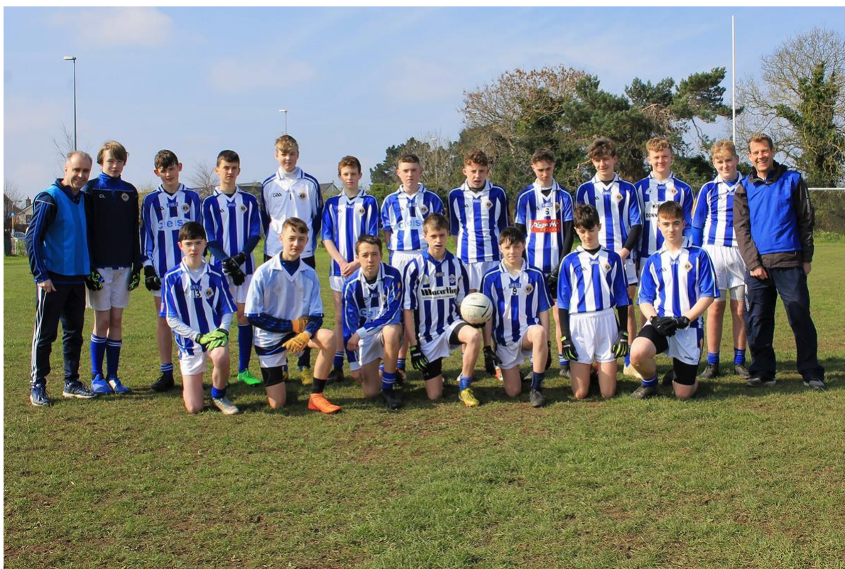
Ballyboden St Endas C 4-10 Erins Isle B 2-7

On a bright and fresh Sunday morning, our C team took to the Cherryfield Road pitch in the Opening Round of the Championship.