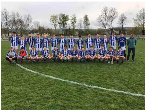
Inters vs OP/ER