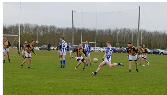
Junior As vs Naomh Mearnog