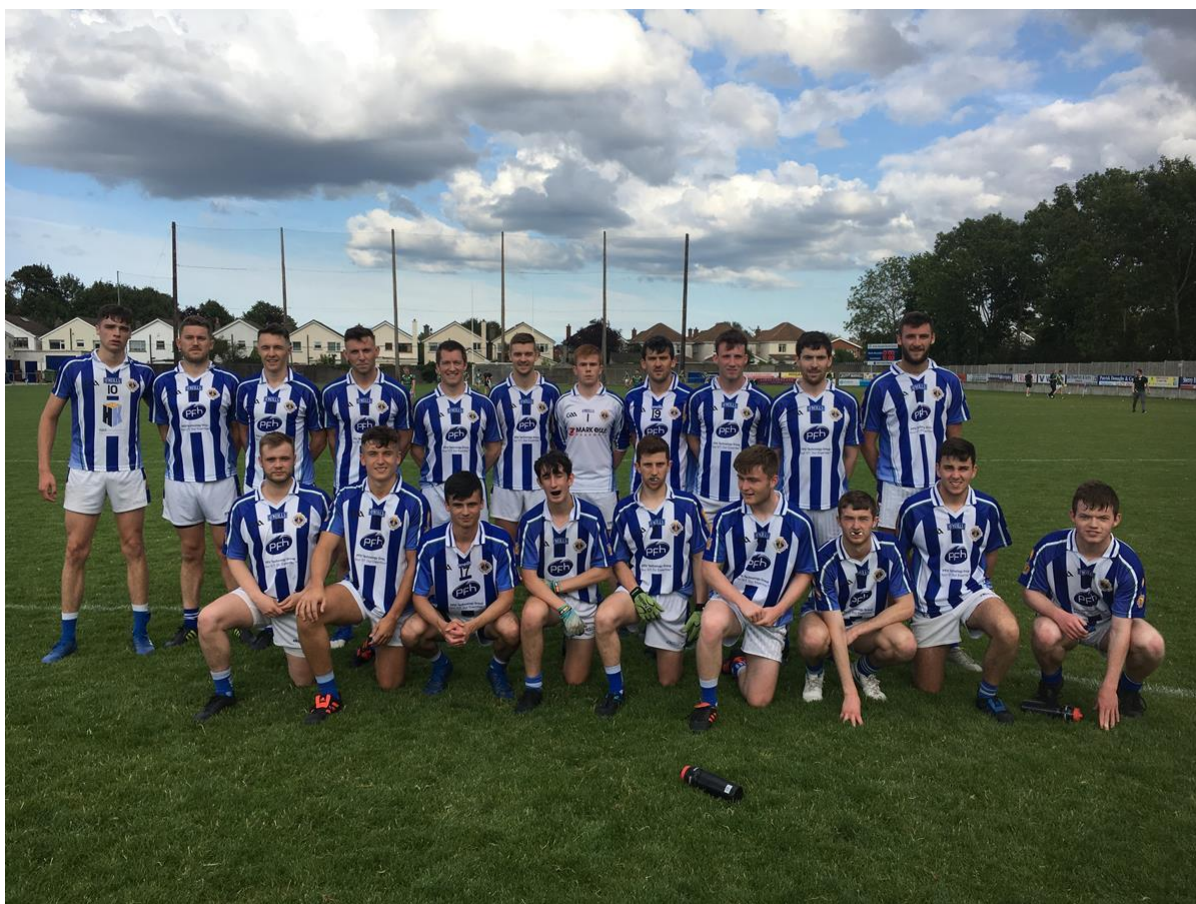
St. Brigid's 0-23 Erin's Isle 2-11

Páirc Uí Mhurchú was the venue for the latest installment in Boden's intermediate league odyssey. This time the opponent's came in the form of Erin's Isle against whom there have been close encounters in recent years. With a contingent in Thailand and others scattered around the globe the squad welcomed some new additions - the introductory pleasantries were duly made and the lads were initiated.